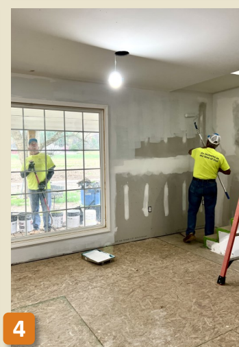
Photo 1 - The mission team presented the homeowners with a cutting board signed with encouraging messages to serve as a reminder that God loves them and CCTV will continue to pray for them. Photo 2 - The CCTV Disaster Recovery Mission Team that served in Jonesborough, TN. Photo 3 - The exterior crew removed vinyl siding damaged by the 8-foot flood waters that rose from the Nolichucky River at the back of the home. Photo 4 - The team worked tirelessly on both the interior and the exterior of the home