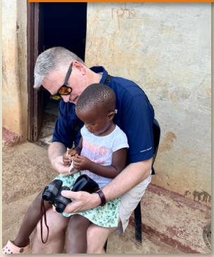
South Africa Missions Trip

This past Lenten Season our pastors led us through a series based on cultivating our hearts. One week specifically focused on cultivating generosity, expounding on the sin of greed: placing one's own needs above God's. We combat greed by living out a Gospel-centered generosity. Where greed can cause us to look inward, generosity empowers us to look outward with our words and actions in addition to our finances. In hopes to celebrate and challenge us as a congregation, we will be highlighting different services and missions here at the Community Church in upcoming newsletters and publications. Our prayer is that this will not only be educational for everyone but will inspire you to give of your time, talents, and treasures more freely.